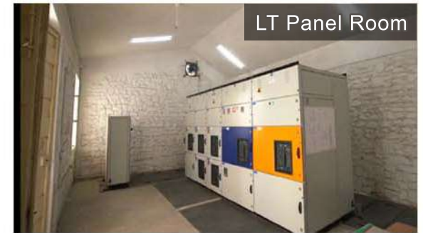
LT Panel Room