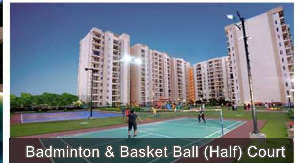
Badminton & Basket Ball (Half) Court