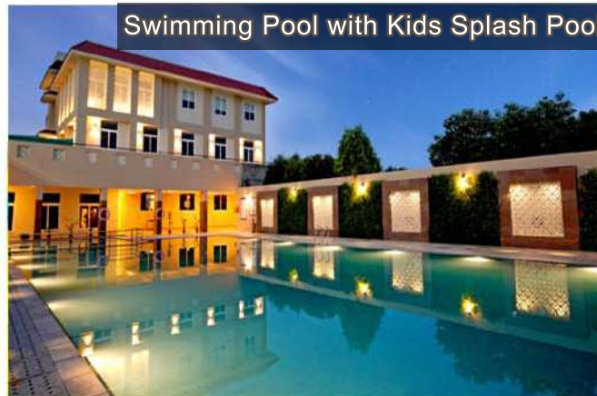
Swimming Pool with Kids Splash Pool